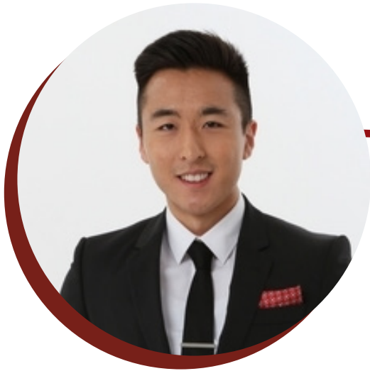
editor in chief